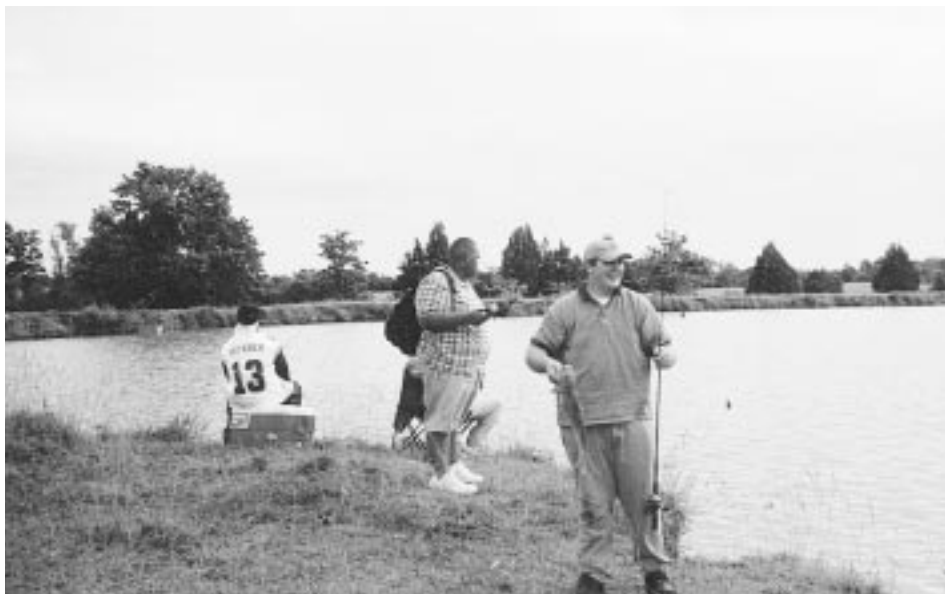
Fishing is a favorite with everyone.

How can the Alabama Forestry Camp end without having a TREASURE Forest day? During this session, the students visited a TREASURE Forest to experience the importance of land stewardship. Smith & Sons TREASURE Forest in Greene